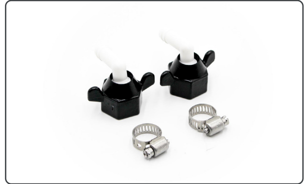
CRT-041 Pump Elbow-Screw Nut to 3/8' Tube Barb (Spare parts kit)