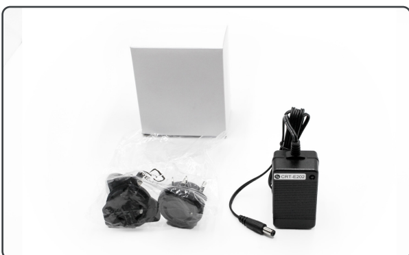
CRT-E202 HydroFill charger 3 pin UK 220VAC / 12VDC 2.1mm