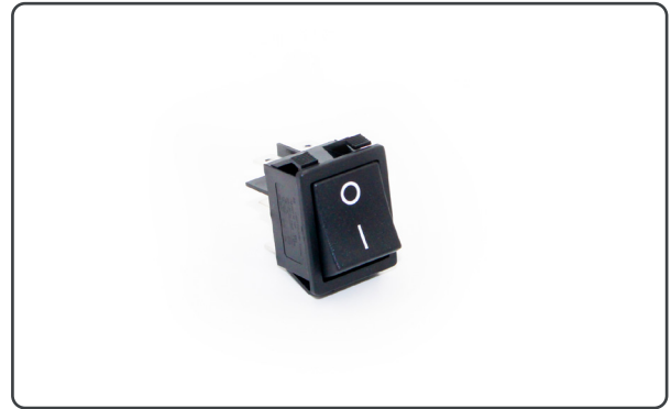
INJ-E066 HydroCart Rocker Switch