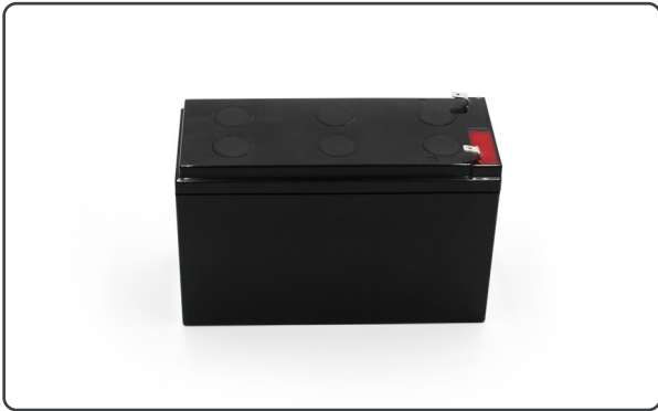
CRT-095 Battery 12VDC