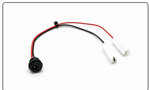
CRT-E200 Plug Jack