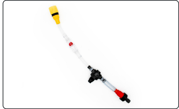
FLT-047 Filling Adaptor