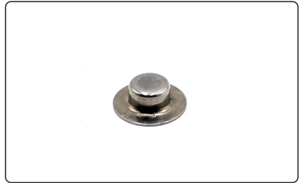
CRT-E206 HydroFill Axle Cap 3/8' (for CRT2A2)