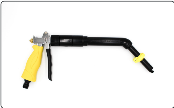
GUN-X Battery Watering Gun