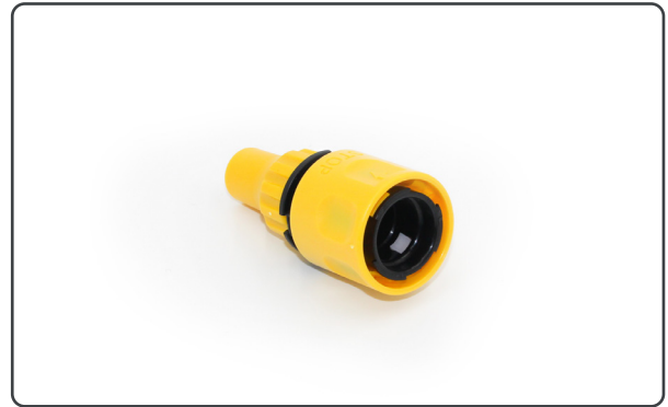
CRT-075 Quick Connect Female Hose Fitting