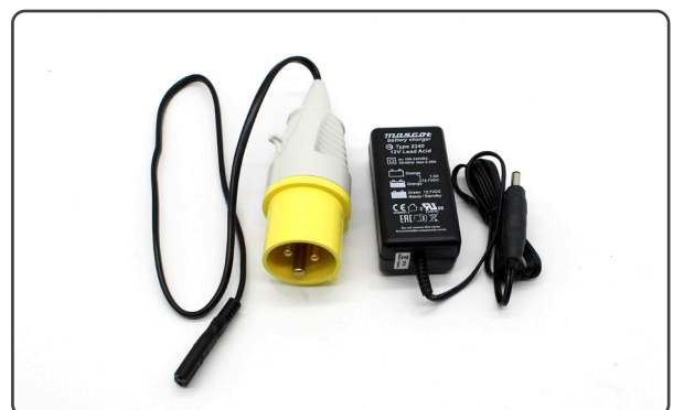
CRT-E203 HydroFill Charger 2 pole & earth 110VAC Industrial 16A 2.1mm