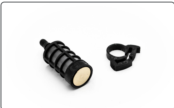
CRT-136 Input Suction Filter and Ratchet Clamp