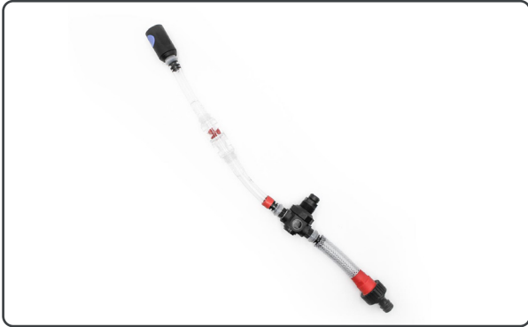
FLT-042 HydroFill to BFS Adaptor