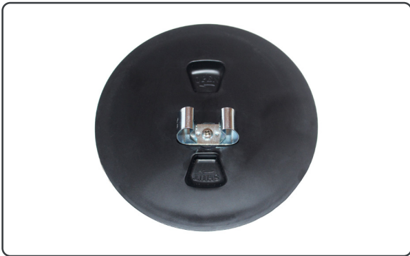
INJ-E068 Tank Lid