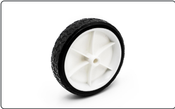
CRT-E205 HydroFill Wheel & Tyre 6' (for CRT2A2)