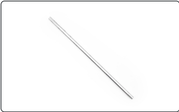
CRT-E207 HydroFill Solid Axle Rod 3/8' (for CRT2A2 HydroFill Cart)